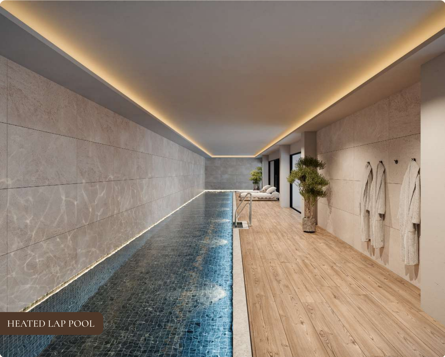
HEATED LAP POOL

For those seeking a balance between rest and productivity, the modern coworking area shares its space with an elegant social lounge , ideal for finding inspiration or enjoying a laid-back gathering. And when it's time to unwind, the exclusive pool bar becomes the perfect meeting spot to enjoy a cocktail and the warm breeze of the sunset.