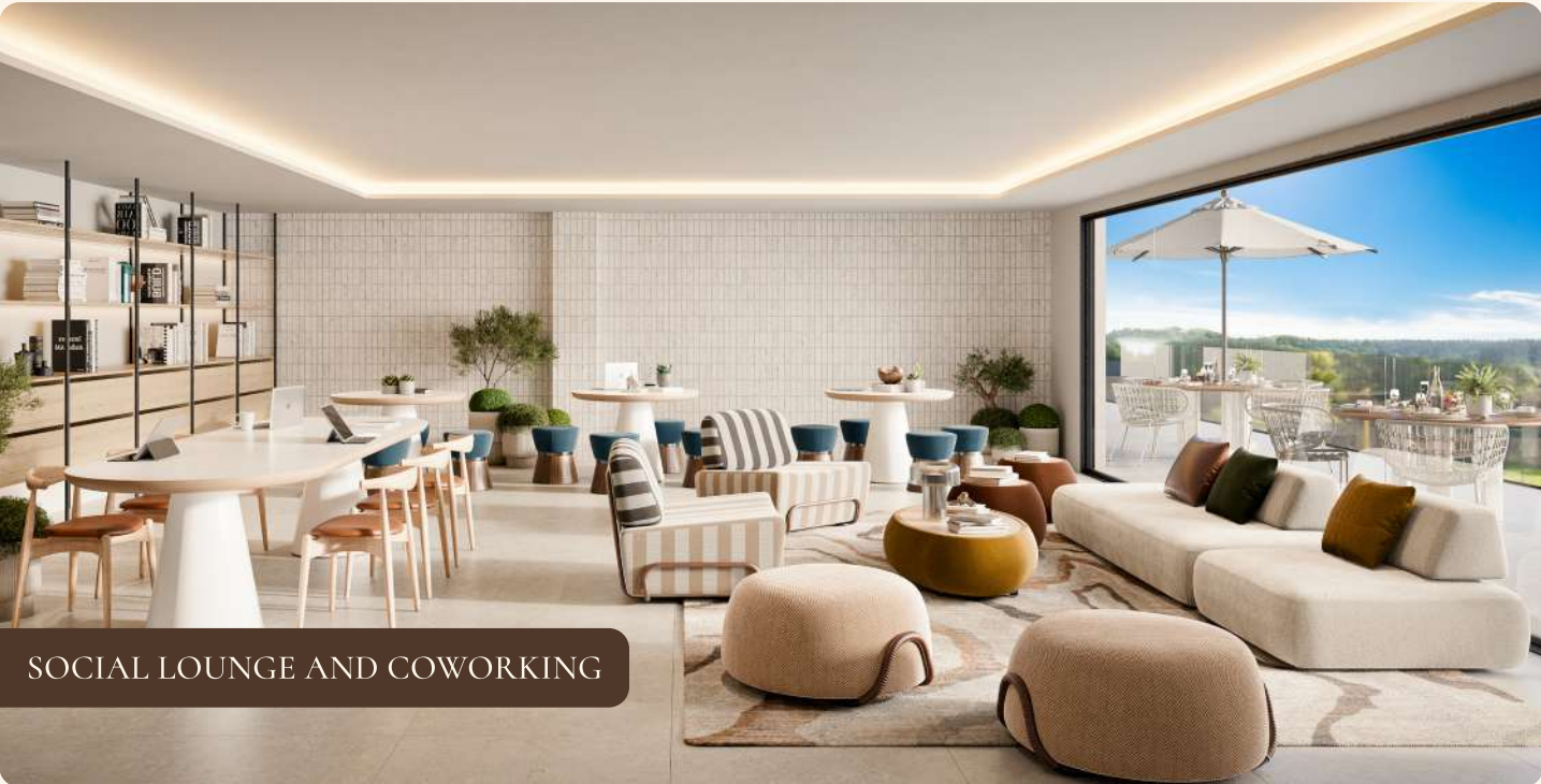
SOCIAL LOUNGE AND COWORKING