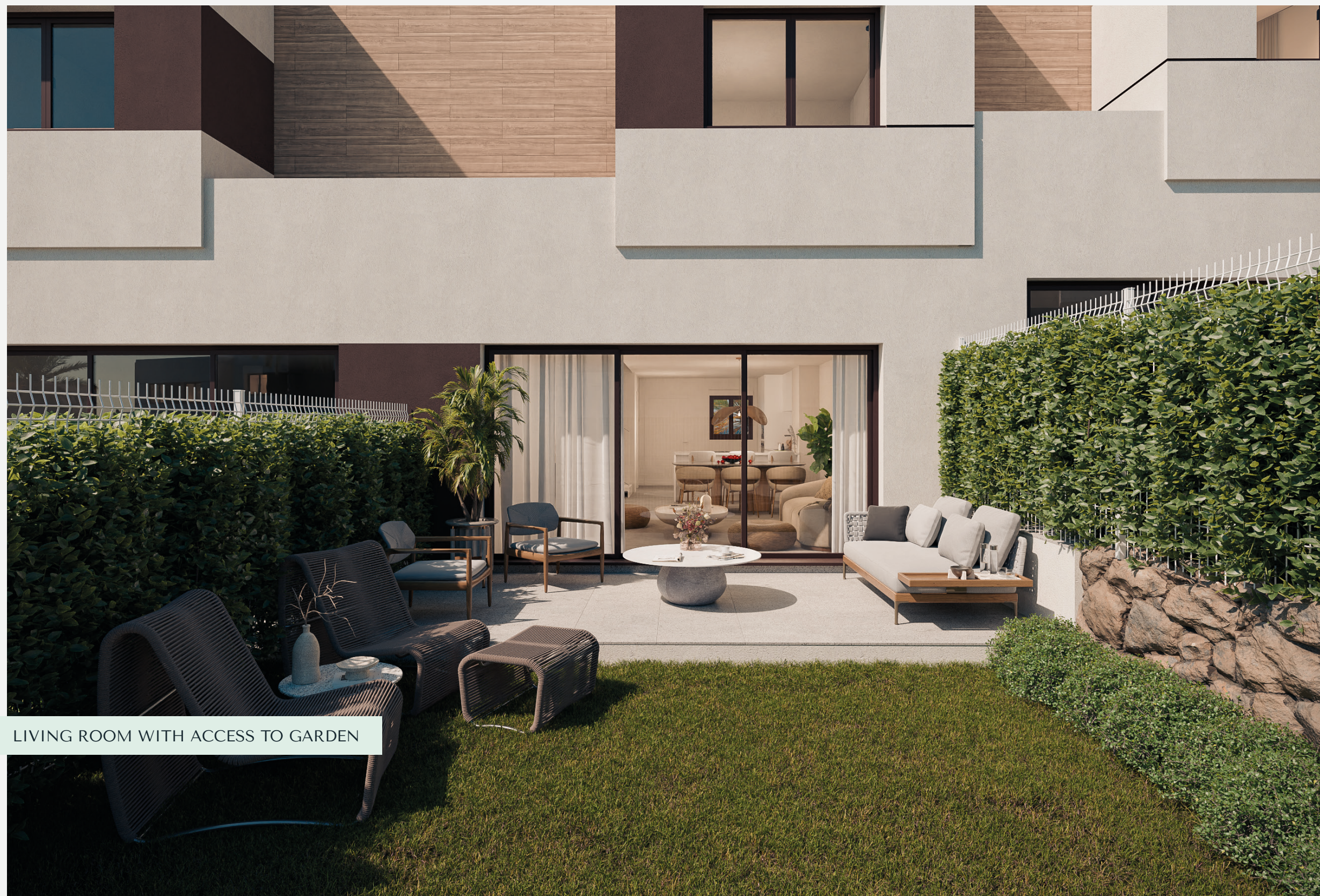
LIVING ROOM WITH ACCESS TO GARDEN

SAVIA presents itself as the perfect place for those looking to build a solid and promising future. A project designed to create a space where families can grow and enjoy themselves, surrounded by all the amenities necessary to enjoy an easy and fulfilling lifestyle. SAVIA is the answer to the dreams of those who wish to live in an environment that promotes a balance between personal and community life.